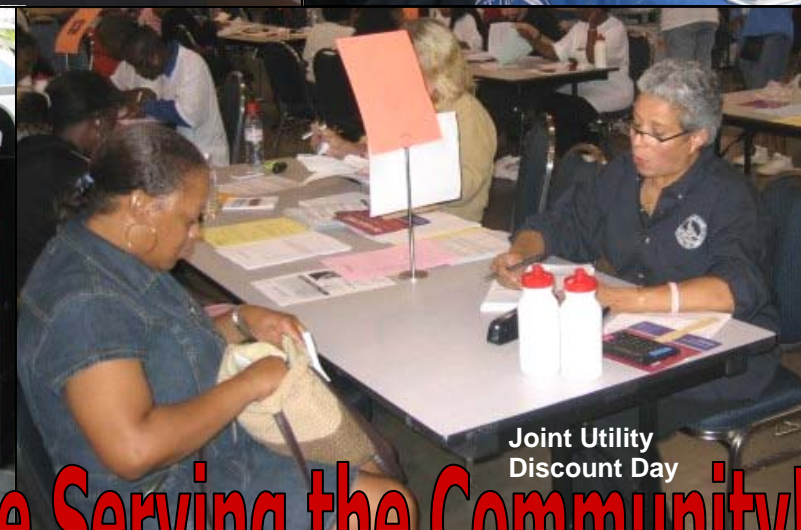
Joint Utility Discount Day