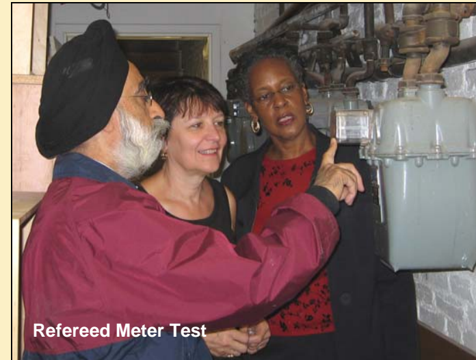
Refereed Meter Test