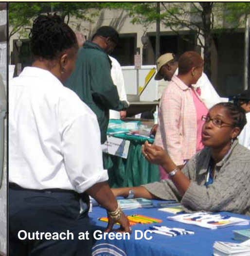
Outreach at Green DC